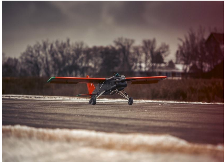
Fig. 2: The Nimkii 42-S standard UAV platform from Sky Canoe in Canada uses a single-cylinder two-stroke SP-55 FI TS ROS engine as the power unit for its transport UAV

Of course, the limitations of this concept are well known. Fuel consumption tends to be higher, emissions are less favorable, and the increased vibrations and reduced smoothness of operation can also cause drawbacks on the system side. Especially with sensitive sensor technology, high-precision imaging, or particularly demanding ISR missions, this can lead to higher requirements for decoupling, structural design, and signal stability. This is precisely why engine selection always comes down to a matter of priorities.