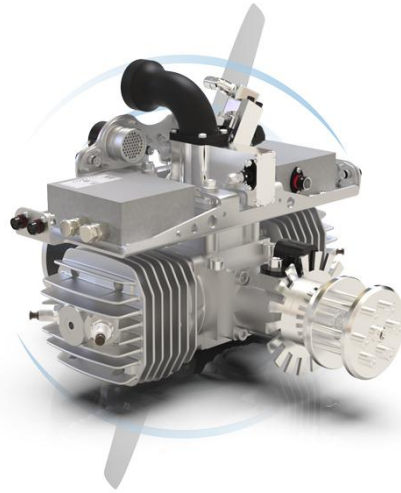
Fig. 1: Sky Power International SP-110 FI TS two-stroke engine with fuel injection

The concept also offers clear advantages in terms of maintenance strategy. Systems with lower design complexity are typically easier to diagnose, quicker to repair, and easier to handle in the field. For operators who do not work exclusively in highly standardized maintenance environments, this can be a decisive factor.