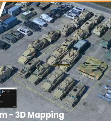
MagiCam - 3D Mapping