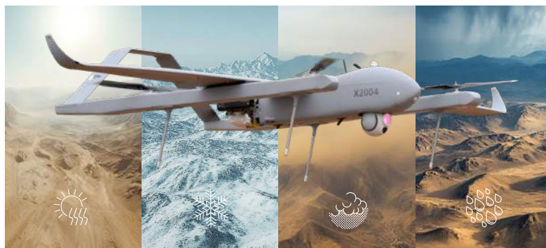
Image shows Aerosonde MK 4.8 Fixed Wing/VTOL, courtesy and copyright of Textron Systems.

Orbital helps UAV manufacturers outperform their competition by delivering integrated propulsion systems engineered specifically for maximum reliability, seamless integration, and mission-critical performance.