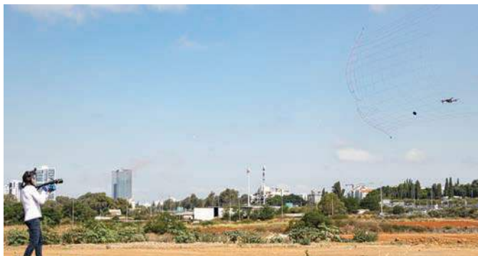
▲ Hand-Held Net Launcher

This new reality requires layered counter-UAS defenses capable of detecting, tracking, and intercepting threats across multiple engagement ranges. This is exactly where DefendAir operates.