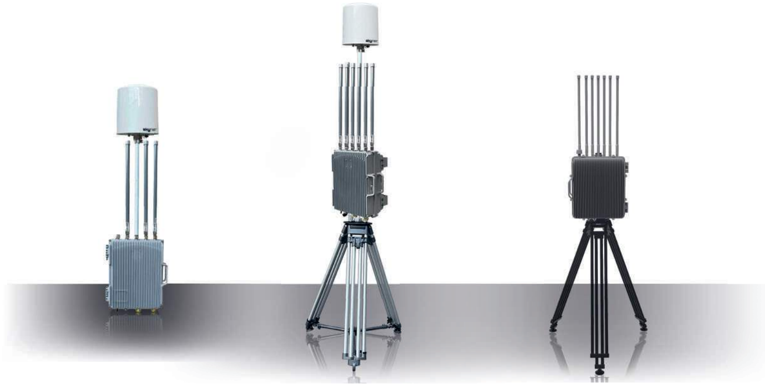
SKYNER BASE SD, SKYNER BASE SDJ, SKYNER BASE J