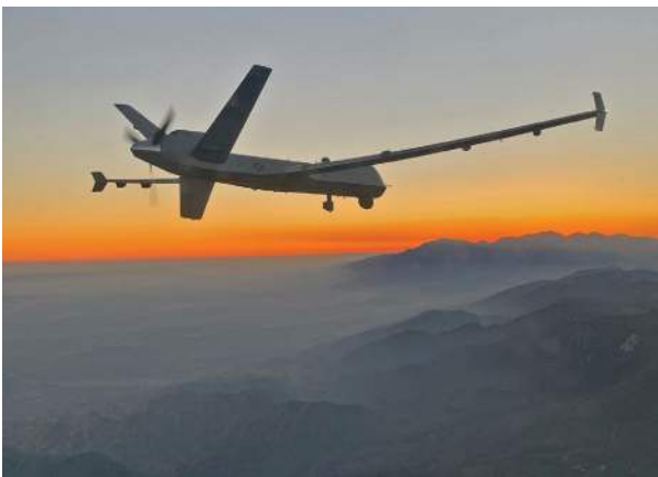
Figure 1: UAVs need the feed streamed remotely in as timely a fashion as possible, otherwise the mission may be compromised.

The real challenge is dealing with the low bandwidth available to stream video. All transmissions must be sent wirelessly, and ground control may be a long distance away, especially when it involves remote controlled Unmanned Aerial Vehicle (UAV) or intelligence gathering missions (Figure 1). Wireless transmission is usually performed in an atypical method with limited bandwidth, like a cellular relay or satellite transmission. This often puts a strict limitation on the data transfer rate of video.