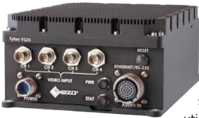
Figure 3: The Tyton VS2X supports H.265 and H.264 encoding with 4x 3G SDI inputs and KLV metadata parsing.

Based on implementation and application need, there is the possibility to implement a system which highly alleviates this tradeoff simply via brute force with multiple streams. If the encoding product has multiple dedicated encoders on board which can be customized individually and bandwidth availability permits, then both encoders can be utilized to meet all needs. For example, one encoded stream can be set to encode at the full 30 frames per second at low quality ensuring every frame is sent timely and with no frame drop. The other encoded stream can be set to encode at a higher quality but at a lower framerate (5fps for example) and with more leniency for buffering. This way a video feed can be analyzed in real time with no frame loss for live use and the second higher quality stream can be recorded (locally) or referenced live if there is a sudden need for high visual fidelity.