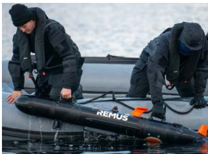
Dutch Navy REMUS Team recovers the Autonomous Underwater Vehicle during Trident Juncture 18.

The open architecture and modularity of the REMUS Technology Platform facilitates increased capabilities, interoperability and applications while decreasing risk and cost.