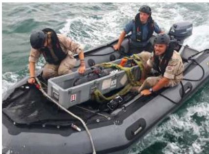
Royal Canadian Navy members train with a Royal Netherlands Navy autonomous underwater vehicle team during the Rim of the Pacific (RIMPAC) exercise.