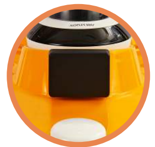
Millimeter Wave Radar