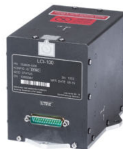
NORTHROP GRUMMAN LITEF LCI-100