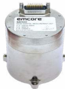
EMCORE/SYSTRON DONNER SDI500