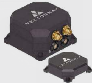
VN-310/310E DUAL GNSS/INS

VectorNav's Tactical Series features auxiliary ports to connect to external Inertial Measurement Units and SAASM or M-Code GPS receivers. The extended capabilities of the Tactical Series enable users to take advantage of VectorNav's superior navigation algorithms while incorporating other technologies to enhance capabilities, security and performance in contested environments.