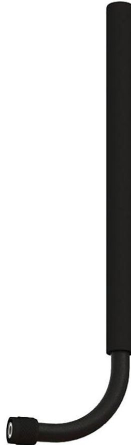
Part # 1001-164