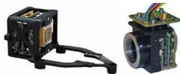
OEM options from board level camera to custom designs available in a range of sensors, interfaces and layouts