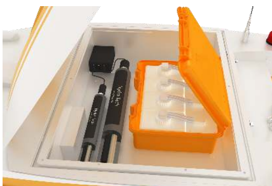
Water sampling and monitoring