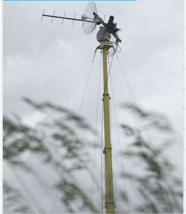
130+ km configuration