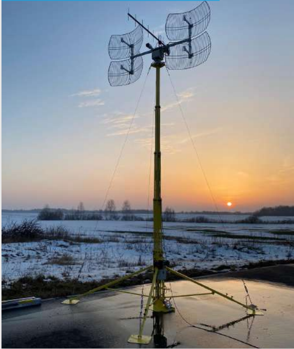
220+ km configuration

Choose depending on what the mission requires: