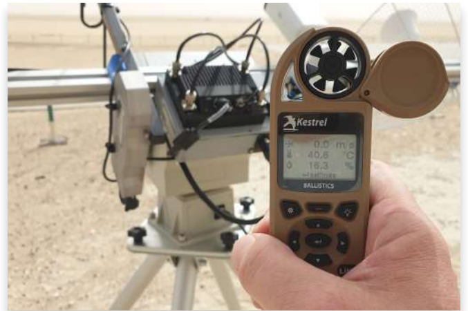
To +40 °C