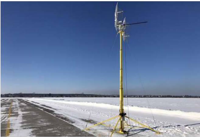
From -20 °C