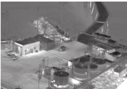
Oil Refinery depot