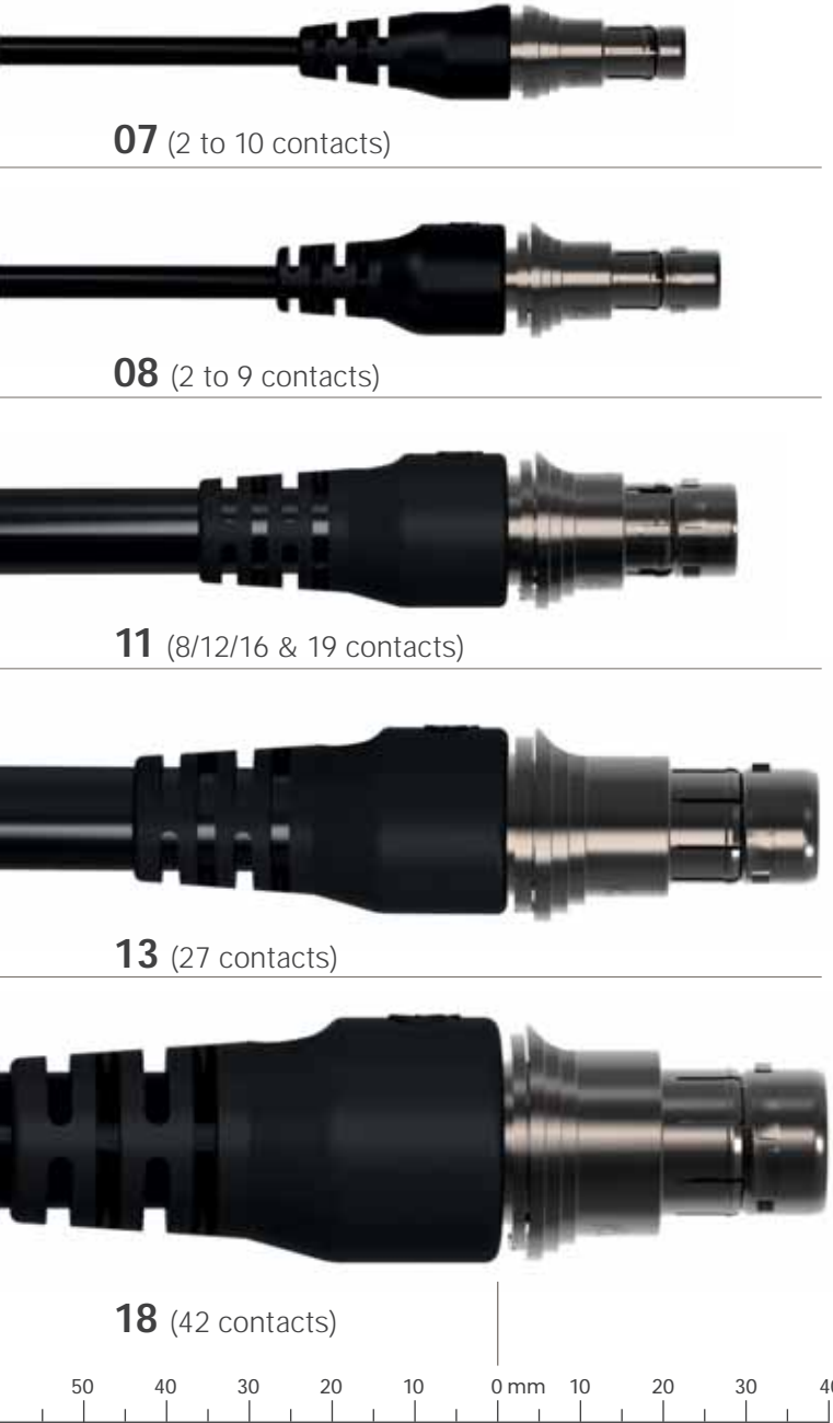
07 (2 to 10 contacts)