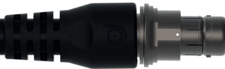
18 (42 contacts)