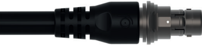
11 (8/12/16 & 19 contacts)