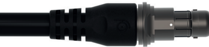
13 (2+3/3+3/27 contacts)